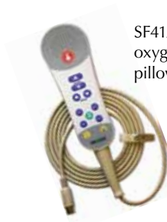
SF41ZDL oxygen-safe pillow speaker