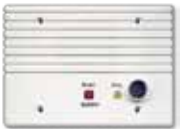
IR319B single bed station