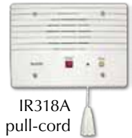
IR318A pull-cord station