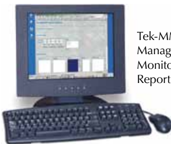
Tek-MMARS®II Management Monitoring & Reporting