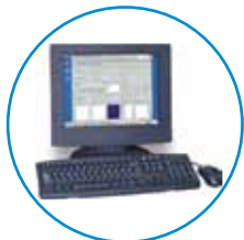
management monitoring and reporting system