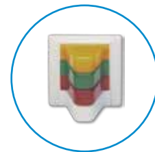
corridor dome light