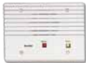
IR310C staff station