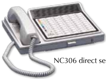
NC306 direct select master