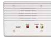
IR315E duty station