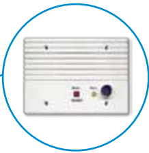
single bed station