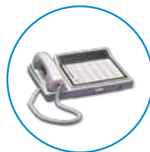
direct select master station