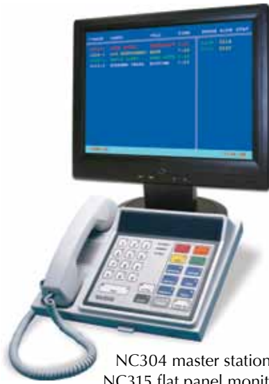
NC304 master station NC315 flat panel monitor