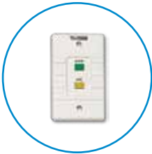
staff presence switch