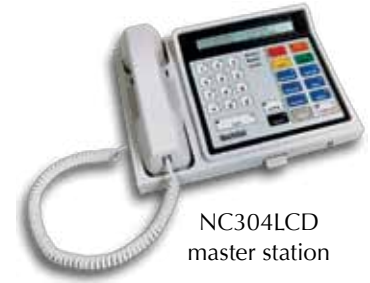
NC304LCD master station