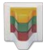
LI380 corridor dome light