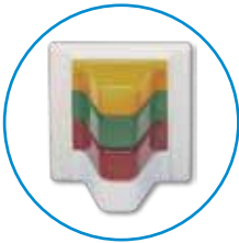
corridor dome light